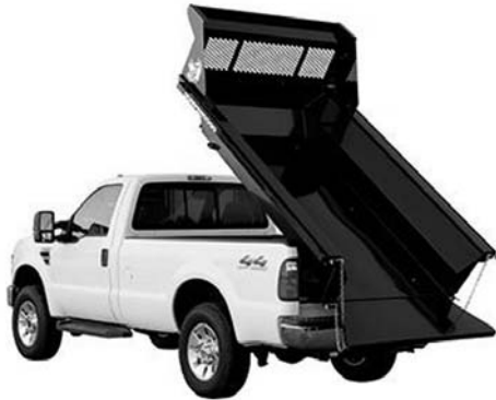
Shown with optional cab guard 5531010