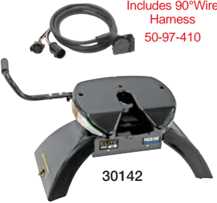
Includes 90° Wire Harness 50-97-410