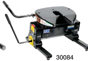
30084 Reese® 20K fifth wheel offered with square tube slider