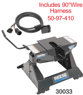
Includes 90° Wire Harness 50-97-410

Note: Will not fit trucks with beds shorter than 6' in length unless used with Sidewinder™. Will not fit trucks with flareside/stepside.