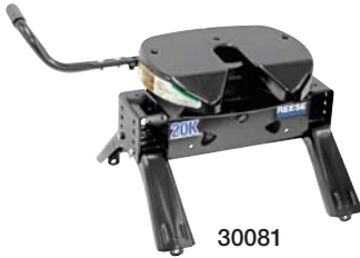
30081 Reese® 20K fifth wheel