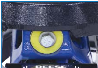
CAST PIVOT BEAM