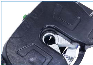
CAST HEAD & JAW