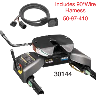
Includes 90° Wire Harness 50-97-410