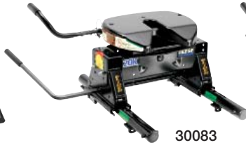
30083 Reese® 20K fifth wheel offered with round tube slider