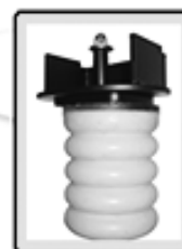
SUMO SPRINGS REAR