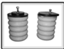
SUMO SPRINGS FRONT